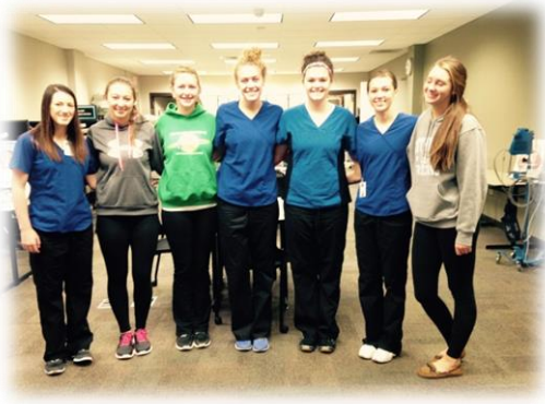
Members of LCCPA's First CNA Class!

As my senior year is coming to an end I can see my life coming together. During the first term of my senior year I was enrolled in a Certified Nursing Assistant (CNA) course through Fox Valley Technical College which helped confirm my desire to pursue a career in healthcare.